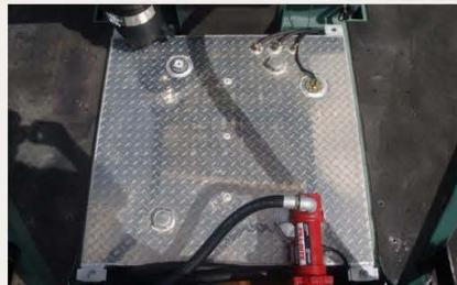
AUX. FUEL TRANSFER TANK