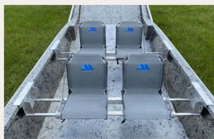
SLICK SLED™ SEATS