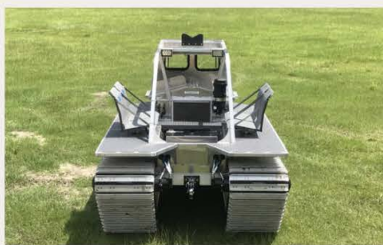
MM-2LX REAR SEATS